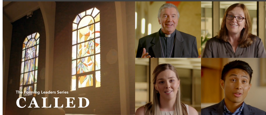
The Forming Leaders Series CALLED

CLFN Forming Leaders Series: Called This Seminar will introduce you to this exciting new training resource.